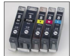
5 Individual Ink Tanks