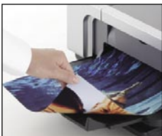
Automatic Duplex Printing