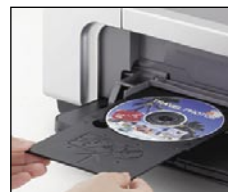
Prints directly on CD and DVD media

Use the CD-LabelPrint software to create your own label designs and print them directly onto printable CDs and DVDs. Print images and text onto your favourite music compilation CD or holiday DVD. You can even print multiple thumbnail images for easy reference to the photos stored on your CD or DVD.