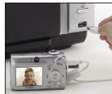
PictBridge Direct Printing