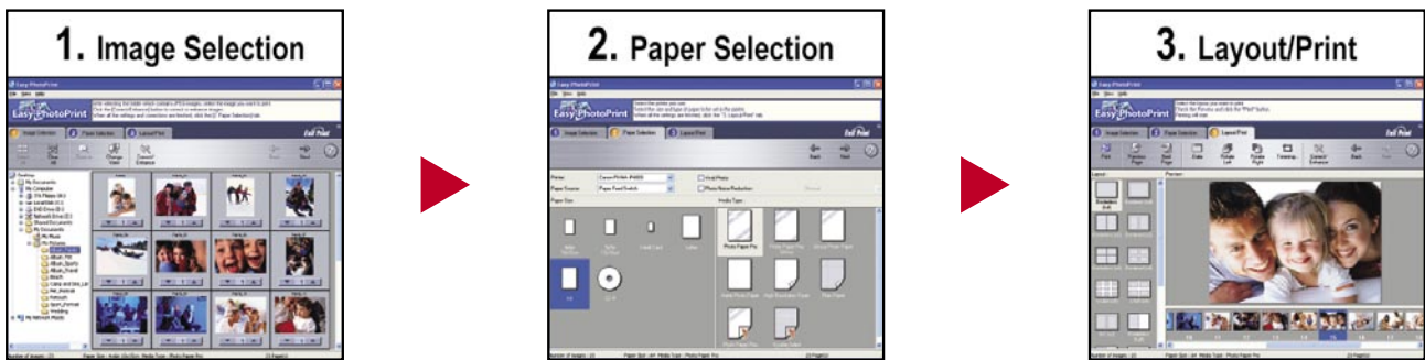
Easy-PhotoPrint – Simple 3 step process