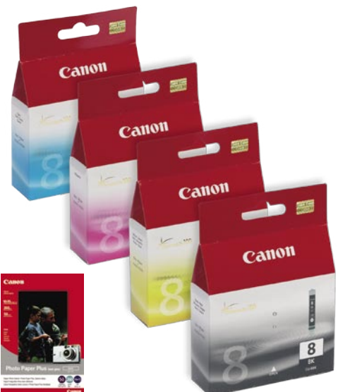
ChromaLife 100 Ink