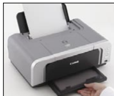
2-Way Paper Feeding