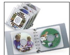
Create your own CD or DVD labels