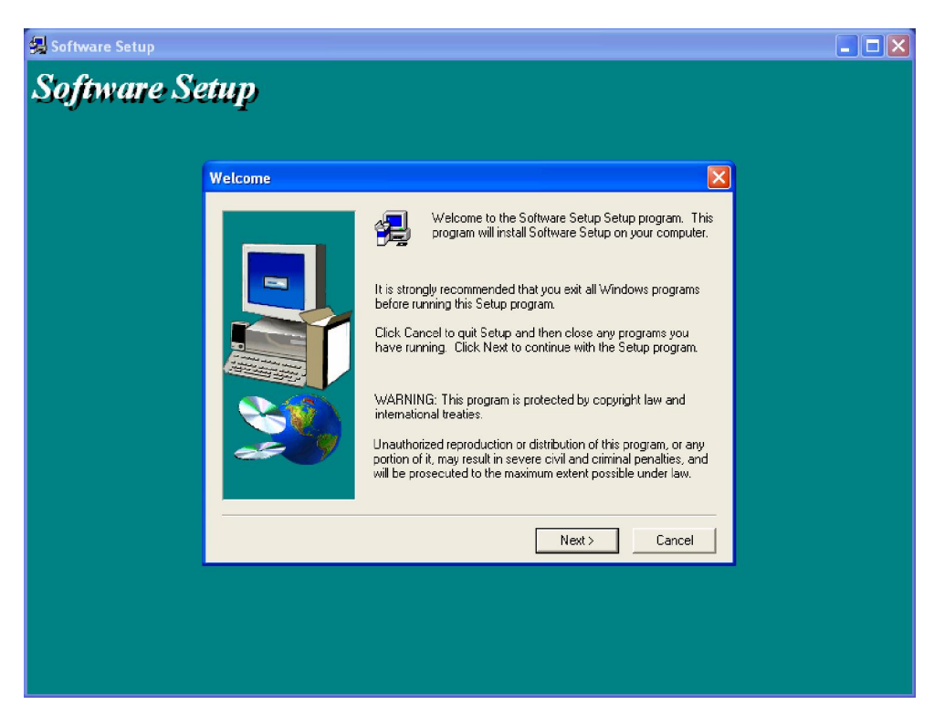
Figure 3 – HP Software Setup Welcome Screen