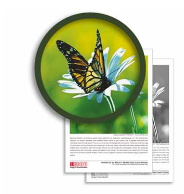
Thanks to its excellent maximum resolution of 600 dpi, scanning with the Aficio™CL7000 MF means obtaining professional colour image quality.

To optimise your office's efficiency, you can combine documents with different settings created in a variety of applications via the system's bundled DeskTopBinder™ software. You can also merge originals scanned on the ARDF and platen glass.