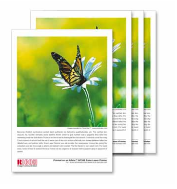
Thanks to the Aficio™CL7000 MF's 'Scan Once, Copy Many' principle, high image quality is guaranteed from the first to the last set.

The Aficio™CL7000 MF connects to almost anything: USB1.1 and 2.0, IEEE 1394, parallel and Ethernet 10 base-T/100 base-TX as well as wireless LAN and Bluetooth. This system prints wireless in every WLAN mode (IEEE 802.11b), freeing your office from cables. With a Bluetooth card installed, you can directly print from PDAs and mobile devices in full colour. Whatever office environment you have, the Aficio™CL7000 MF fits in, easily and reliably.