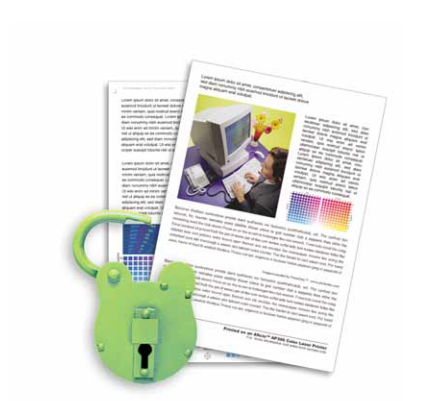
With the Aficio™CL7000 MF's Locked Print™ function all sensitive information is handled securely.