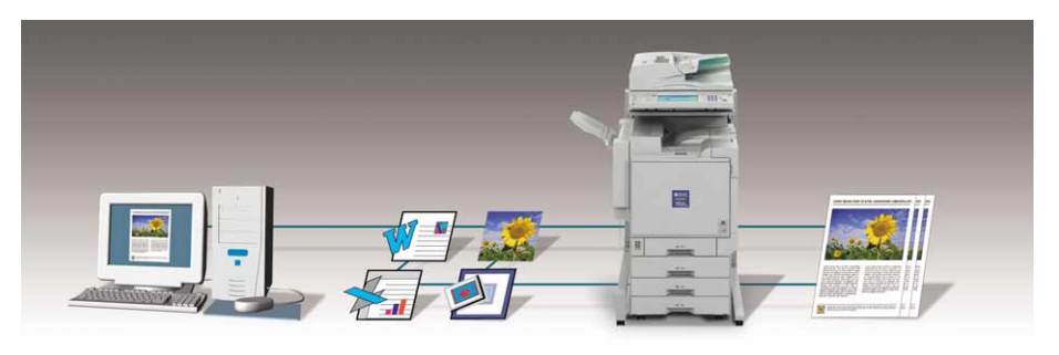
Via DeskTopBinder™, you can combine documents created in different applications on your PC and print them as one file for easy distribution. The same applies to originals scanned on the ARDF and platen glass.