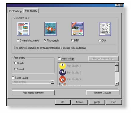
With RPCS™ you can even adjust the print quality of a specific job on your PC screen.

The Aficio™CL7000 MF is designed to streamline your office communications. Instead of walking to the machine, you can now transmit faxes directly from your own computer or any other networked PC thanks to the system's LAN-fax software. This saves you time and paper and quarantees better output quality at the receiving end. Via the optional ScanRouter™ Pro software, incoming faxes can also be redirected automatically to any PC in the network while scanned documents can be sent as e-mail attachments. Additionally, selecting recipients is done in seconds using the Aficio™CL7000 MF's 1,200 quick dial numbers. During peak times you can even send faxes and receive incoming ones simultaneously with the system's optional second fax line.