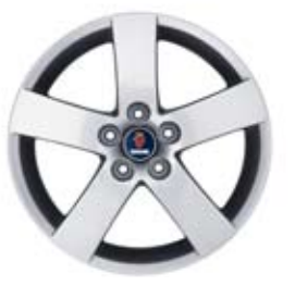
5-spoke EVO – 17×7" alloy wheels (ALU 52).