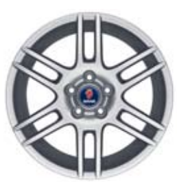
6-spoke Split – 17×7" alloy wheels.