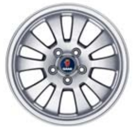
10-spoke Forged – 16×6½" 10-spoke - 16×6½" alloy wheels (ALU 70). alloy wheels (ALU 51).