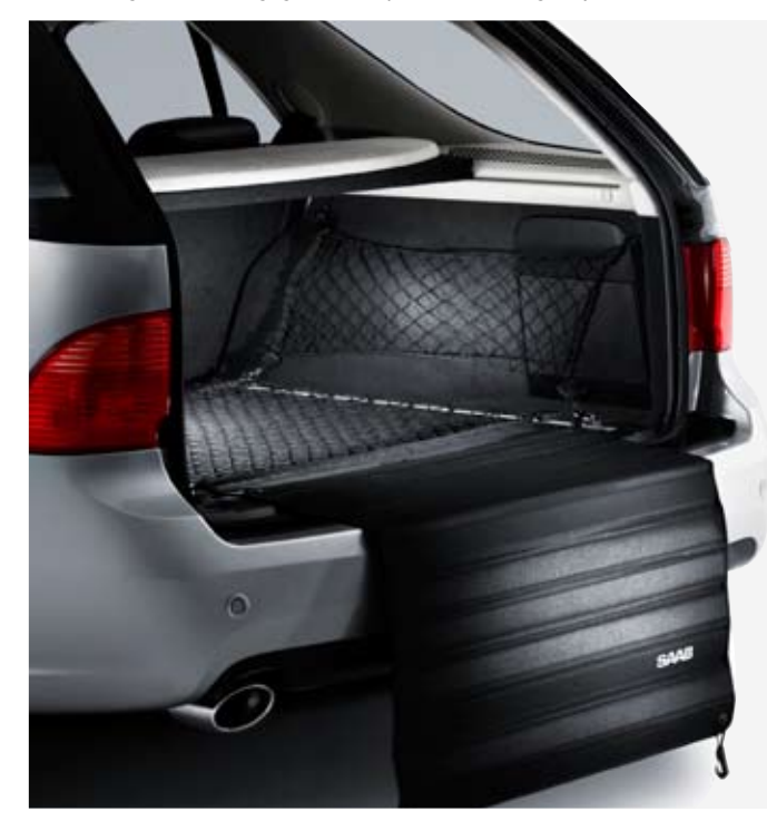
Floor cargo net - holds light items in place and makes the luggage compartment more practical while driving. Elastic and easy to use.

Side cargo net - for fitting on the right-hand side of the luggage compartment. Elastic, designed for holding light items in place while driving. Easy to remove.