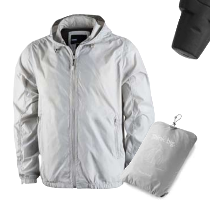
Saab Brand Pocket Jacket – stay warm in this handy packaway jacket in 100% nylon. Strong zippers and two side pockets, one doubling as a carry bag. Adjustable elastic drawstrings.

Saab Car Key USB - keep your personal documents safe with this high-capacity USB thumb, cleverly disguised as a Saab key. Available with 1 or 2 GB.