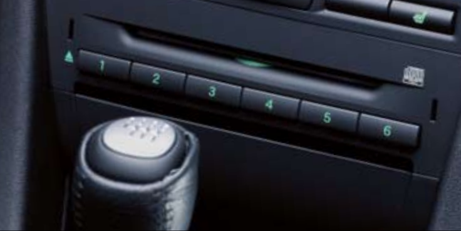
CD changer – mounted in the centre console. Six-disc single-slot. Operated via the steering wheel audio controls or radio main unit. Anti-theft protection, digitally coded to work in your car only. Saab 9-3 until model year 2006.