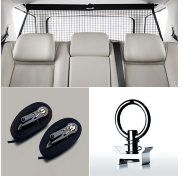
Load straps - for securing heavy loads. Help protect the occupants from shifting loads.

Cargo net – for mounting in line with the rear seat backrest. Separates the passenger compartment from the luggage compartment. Gives the occupants added protection from shifting load in a collision. When not in use, the net can easily be folded and stored. Can be used with the rear seat backrest folded down. Estate only.