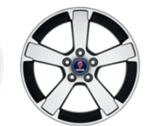
5-spoke - 17×7" alloy wheels.