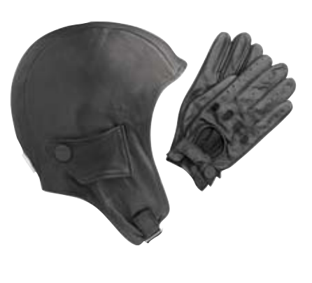
Saab Driver's Helmet and Gloves - the ultimate in car driving wear: fully lined, genuine all-leather driver's helmet and lightweight black lamb'sleather driving gloves to keep your hands warm and improve grip.

Saab Aero Pen - aerodynamic, wing-shaped high-quality brass ball pen, inspired by the