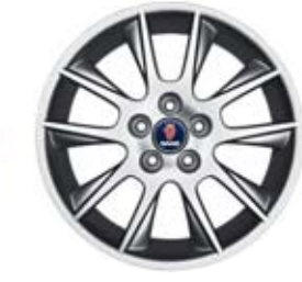
10-spoke – 17×7" alloy wheels (ALU 39).