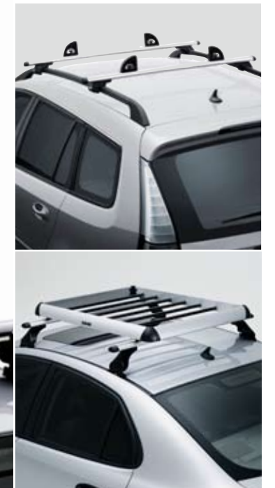
Roof rack, C-track - made of aluminium. Quick-release fasteners make it easy to fit and modify with special holders for skis, bikes, boards, etc. Crash-, corrosion- and

Load stops – kit containing four easy-to-fit load stops. Help prevent the load from sliding sideways. Made of galvanised, polyester-coated sheet steel riveted to polyethylene plastic.