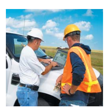
With nearly 200 locations across the globe - you're never far from an independent, authorized Vermeer dealer. Our dealers are in place to support your success with product expertise that's second to none.