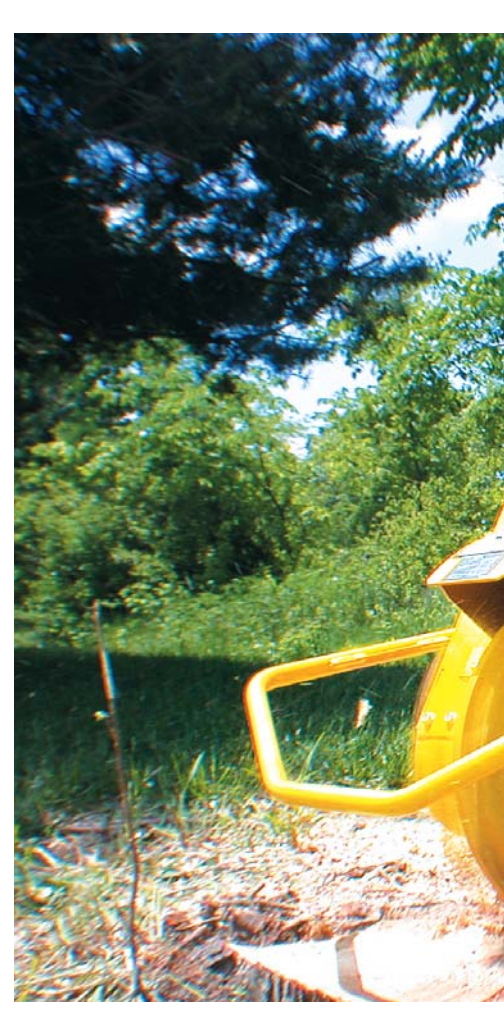
The SC252 optional hydraulic front steer features an oscillating axle for mobility, specially designed steering for tighter turns, an easily accessible single-lever control, and hardened steel pivot pins and bushings.