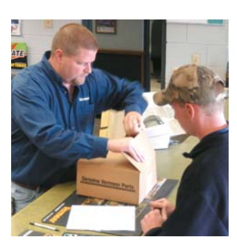
Vermeer parts are designed and manufactured to original specifications, so whether they're new parts or replacement parts, they'll live up to the Vermeer name.