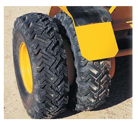
Optional rear dual tires

improve floatation, traction and stability, enabling the operator to work more effectively on uneven terrain.